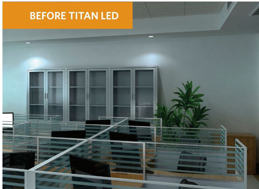
BEFORE TITAN LED